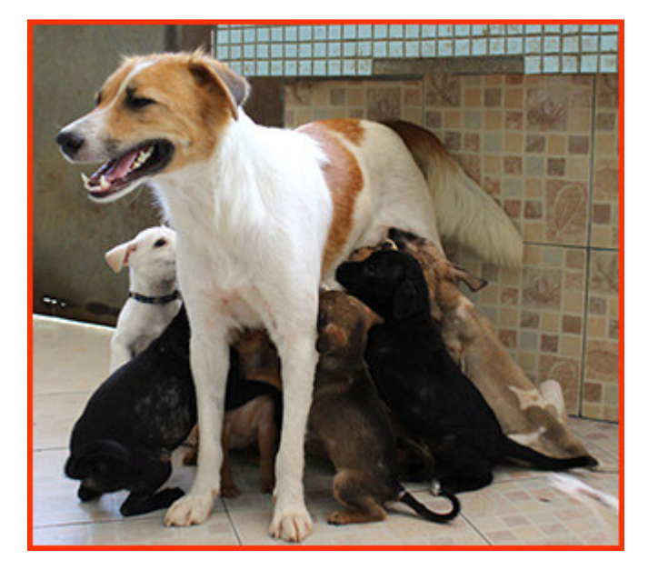
One of the many dog mums that was just abandoned at our door. Unfortunately, the chance of survival for the unvaccinated puppies in our shelter is very low. Also the amount of mothers, who were exposed to us overnight and then got really sick in the shelter, has risen again in the last few months.