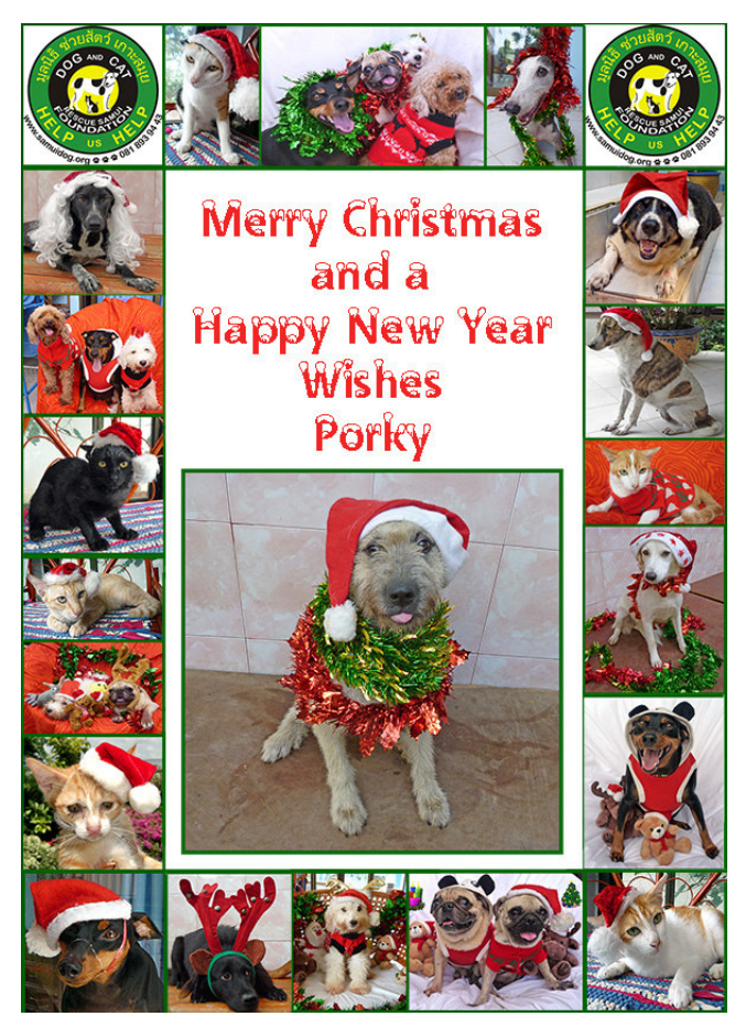
A sponsorship for our dogs or cats Costs 25 Euro/month

When you order from Zooplus.de or Amazon.de we will get between 3,5 and 8,5% from the purchase amount transferred to our bank account. I would be really happy, if you could use our link to shop there. Please go on our german website and hit their logo before you start ordering. www.samuidog.org