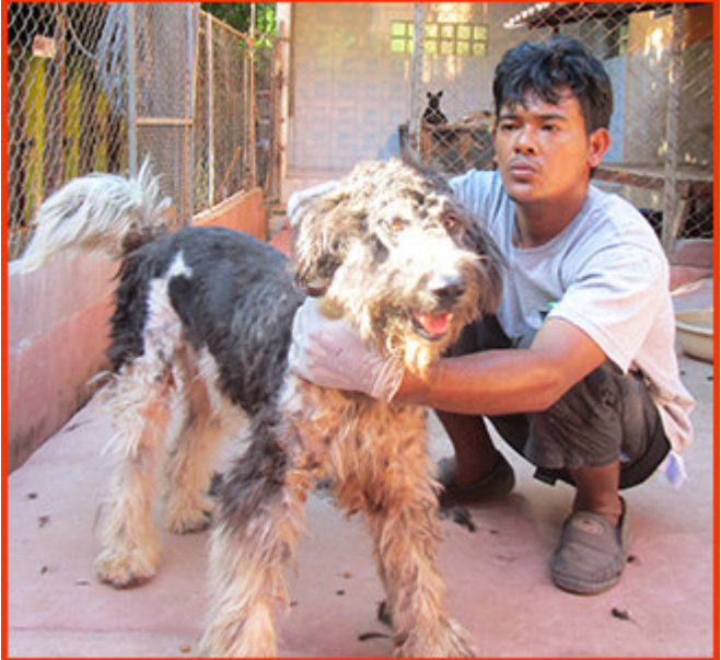
Here, the next two waiting for the grooming appointment at the barber.