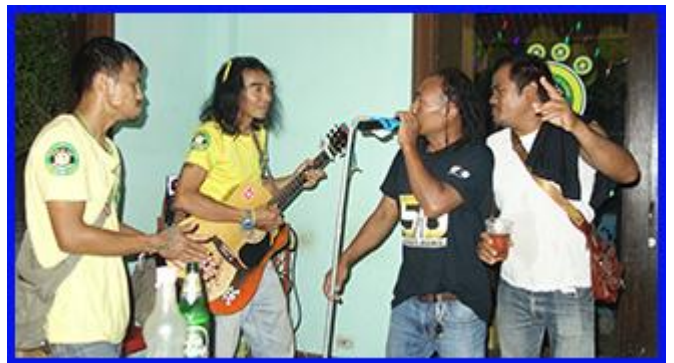
The helpers diligently supported the musicians with singing. Everyone was welcomed to Join.