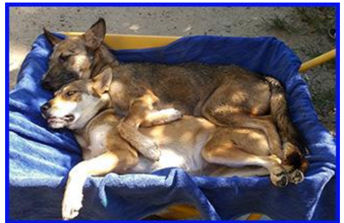
Dog transport after surgery.