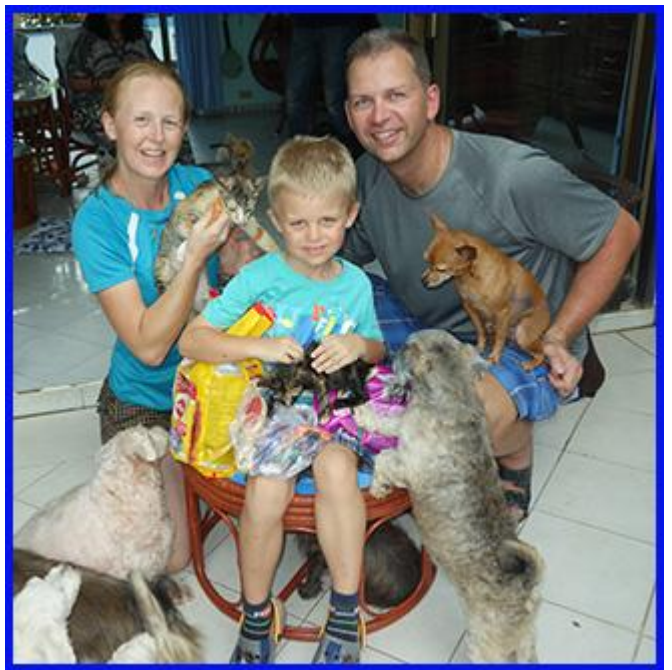
Children always have fun at Chaweng.