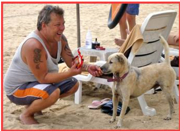
Jogi and Moonlight, who will fly to Norway soon.

These animals do urgently need your support!