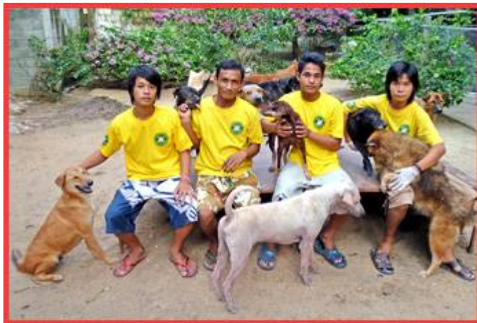
KID, AU, TUI und YO