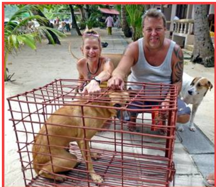
SIT will fly to Germany soon.