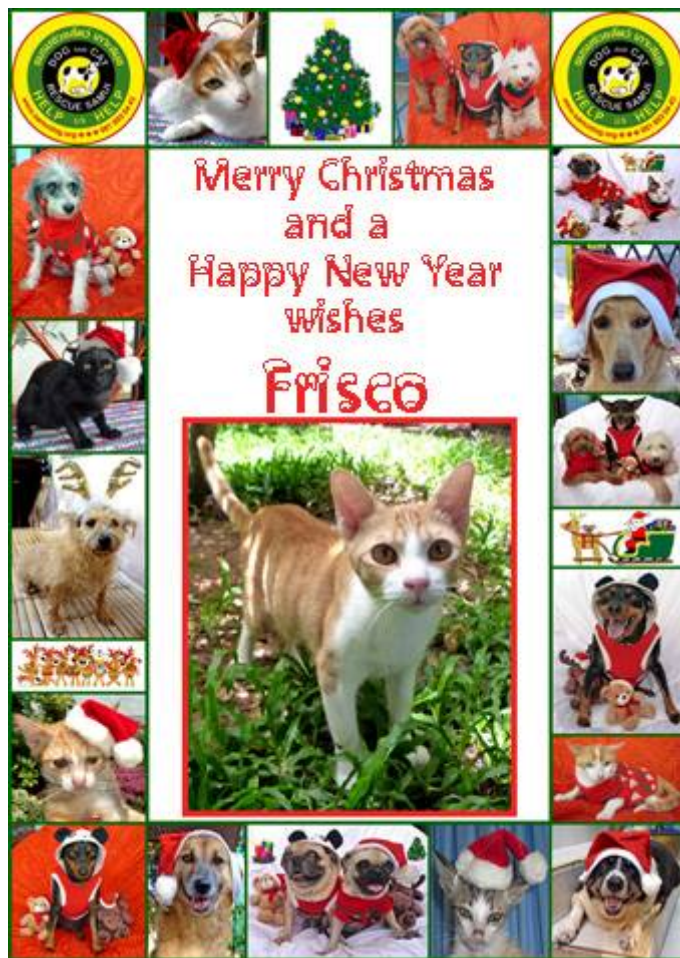
Frisco is just one example of all the cats and dogs that are looking for sponsorship.

For just 15 euro a month you could take over a sponsorship for one of our beloved.