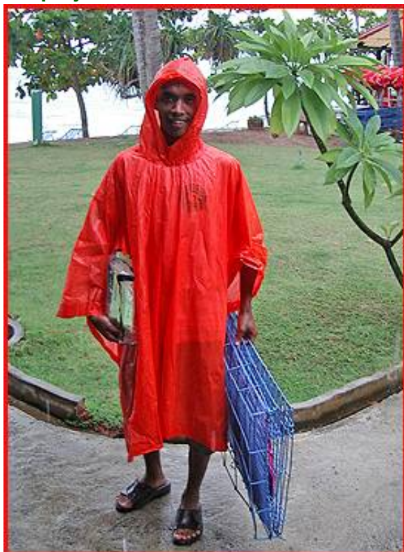
Even during heavy rainfalls dogs need to be caught.