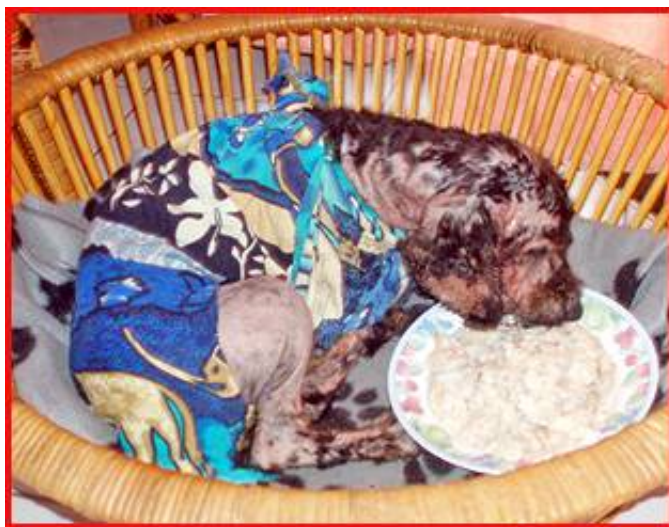
Hmmm! This is this nice!