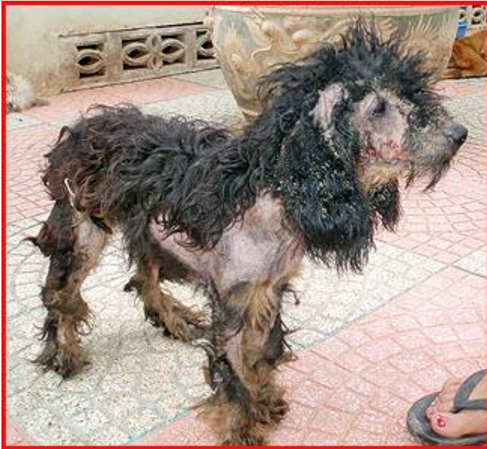
Arrived in Chaweng: 25 October 2006