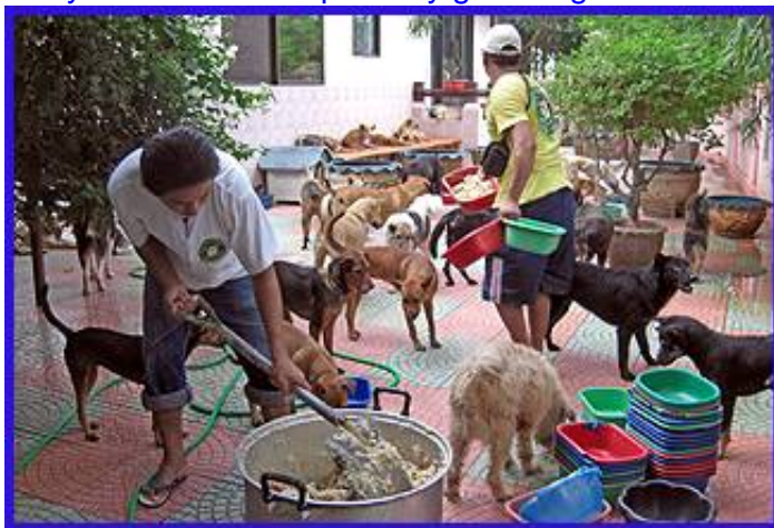
Dog feeding in Chaweng

In case you meet a hungry dog and cannot find a supermarket, here is a little tip; there is a little food stall on every corner that has perfectly good dog treats for the hungry mutts. The dogs especially love fried chicken.