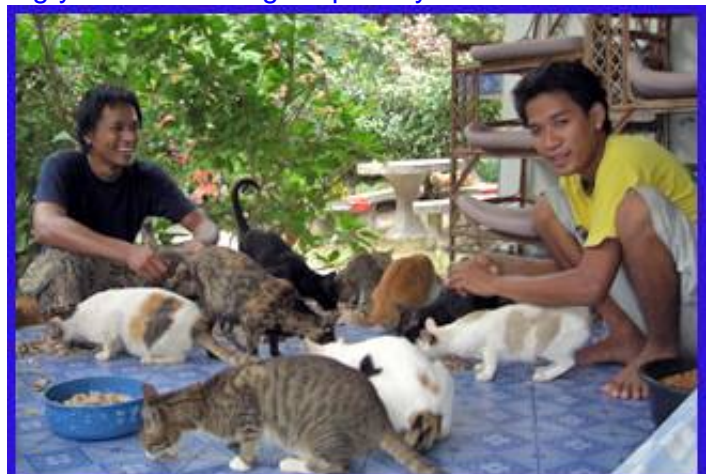
Fish party for the cats in Ban Taling Ngam

Sometimes we do have fried chicken at the shelter, but the main constituent given to us by the hotels and restaurants is rice, which all of our dogs love. These are real Thai dogs! I'm not saying that our dogs would prefer rice to meat, but they do fancy rice with a little meat inside.