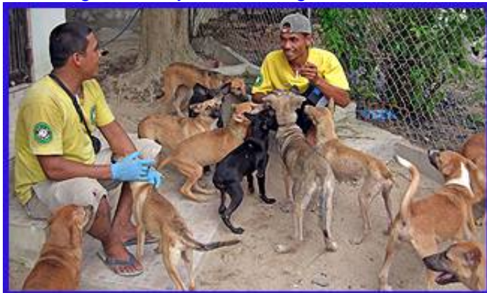
...It doesn't get any easier with the teenagers