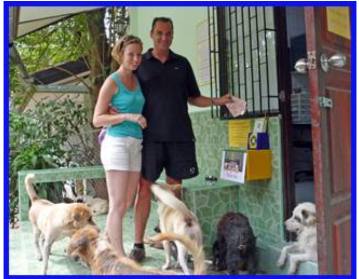
The first tourists found our new donation box. It's a safe, which is welded onto the wall.